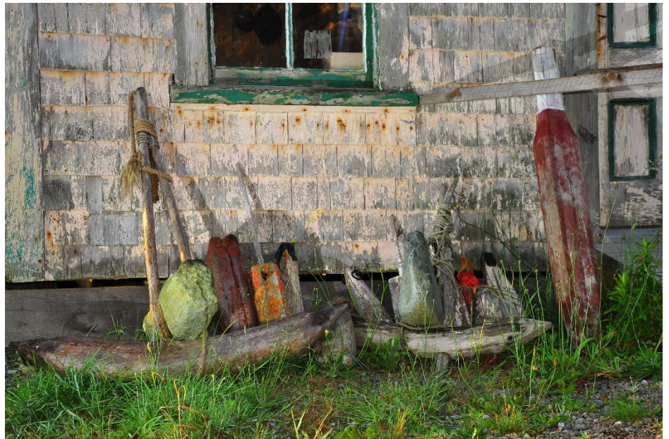
Le Village Historique Acadien de la Nouvelle-Ecosse

The intent of the Operating Reserve is to receive any annual surplus (or pay out any deficit) from or to the Operating Fund. Basically, it is a savings account, used only when needed to support unanticipated events. Historically, it has not paid out a deficit in over 20 years and has been used to fund one-time operational commitments.