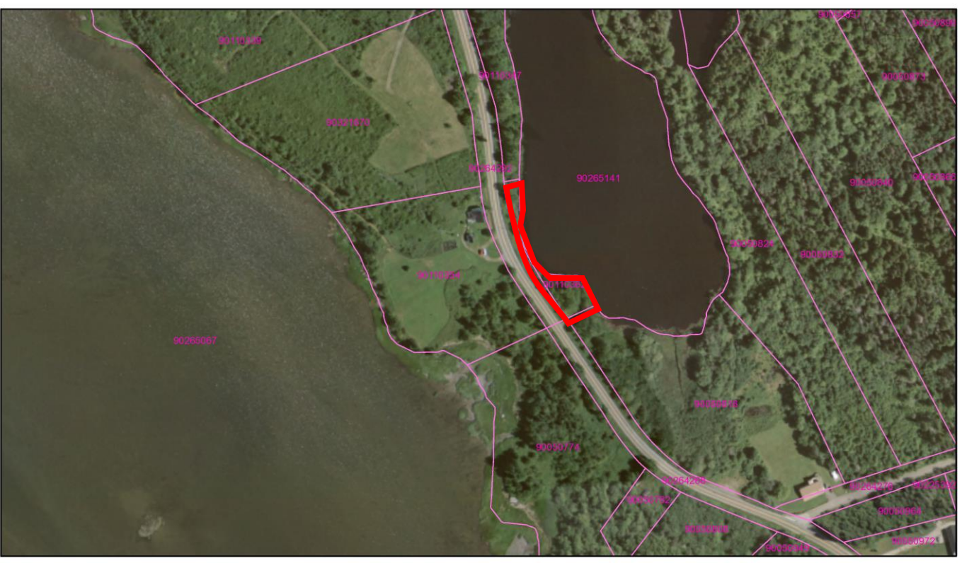
Figure 2: Context Map of the Subject Property

Staff are recommending that a development agreement application should be applied to the subject property. The subject property currently would be appropriate to allow for a marine related - aquaculture use of this low level of intensity.