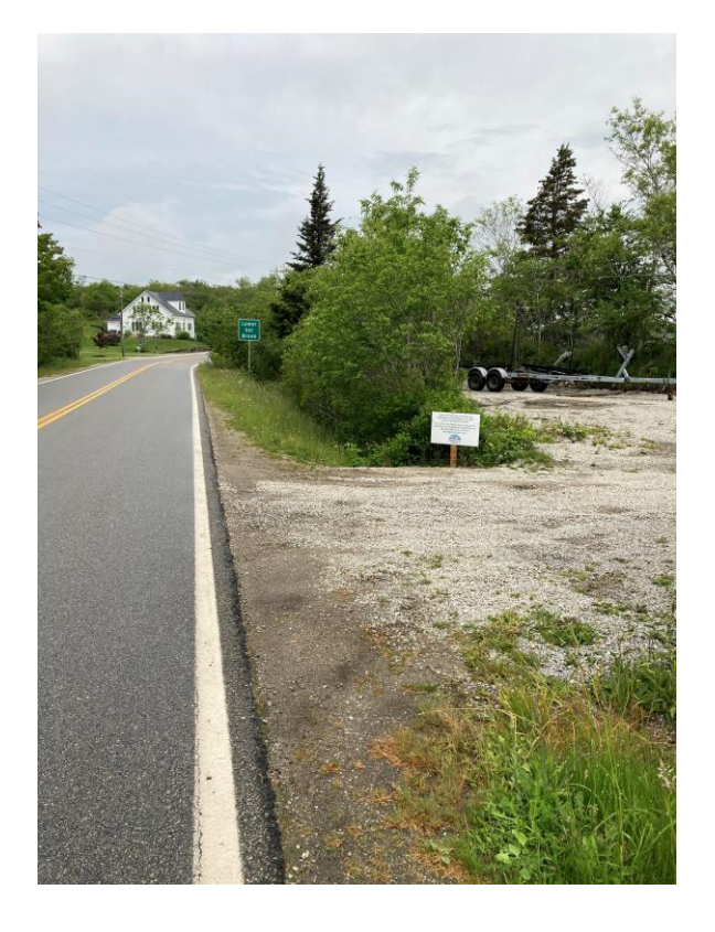
Figure 1: Photo of subject site along Highway 3

That the Planning Advisory Committee recommend to Council to give first reading to the Development Agreement Application of the subject site along Highway 3 (PID 90110362) to allow for a Marine Related - Aquaculture use in the Coastal Community (CC) zone for the purpose of enabling a public hearing.