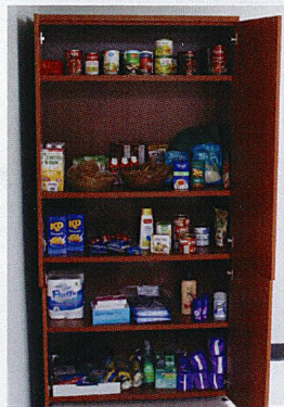
One of the pantries.